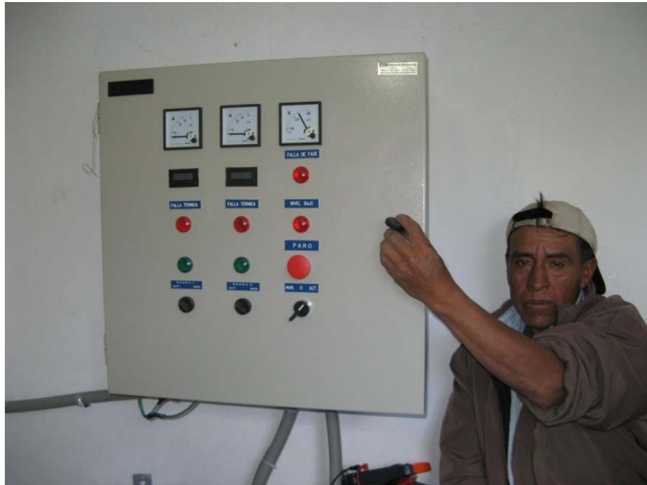
Figure No. 4 Photograph of a simple duplex pump panel with meters for the current draw of each pump and voltage.

Our experience indicates that it is unwise to use PLC's in the pump control logic unless adequate resources are available to help the community reprogram or troubleshoot the PLC when necessary. The frequent power outages in rural areas can cause the PLC to lose its programming. PLC's are not necessary in the pump control logic unless automatic pump alternation is needed. Manual alternation between two pumps can be done on a weekly basis rather than at each cycle, thus eliminating the need for a PLC and reducing cost.