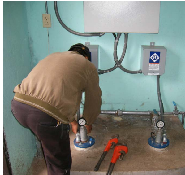
Figure No. 2 Photograph showing a duplex submersible pump installation. Note individual control boxes and pump panel on wall.

Pumps should be normally equipped with a low-level cutoff switch to shut off the pumps when the water level drops excessively at the pump suction. This prevents pump or motor burn out and hence improves sustainability of the pumping equipment. The importance of adequate suction pressure is accentuated for pumps operating at high altitudes because of decreased atmospheric pressure. Pumps should only be operated within the suction pressure range recommended by the manufacturer to avoid damaging cavitation and low pump efficiency.