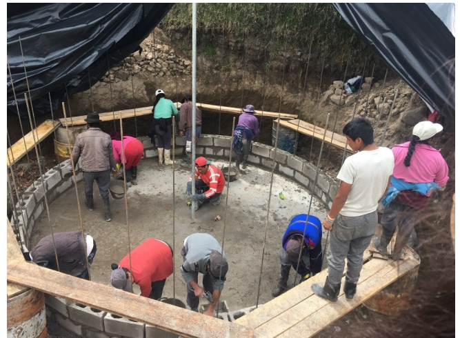
(above) Ulpan and Ainche community members built the reservoirs and installed the pipe with Kawsaypak Yaku and LGWI supervision.

A ministry team worked alongside the community in July and held a VBS event for the children. Hundreds of people attended a showing of The Emmaus Road , a DVD of Jesus' life. We know that physical health and spiritual health go hand in hand. The Life-Giving Water ministry is not just about accessible clean water for optimal physical health, but also about bringing the Presence of our Lord into each community.