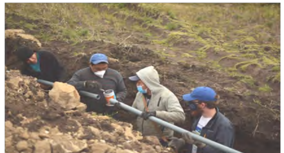
The interns helped install some of the 23 kilometers of pipe for the Santiago de Quito water system.