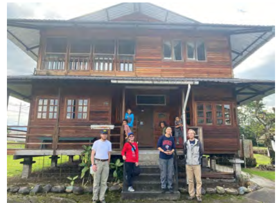
The interns visited the Nate Saint Museum, home of the missionary pilot martyred in 1956.