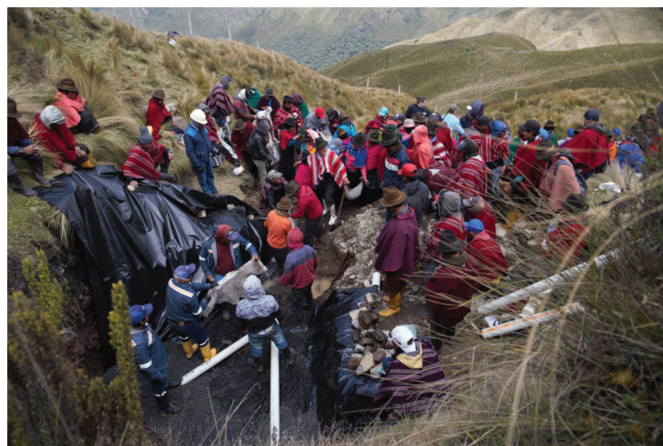
Community members in Pull San Jose work to protect one of the community springs. Hundreds of spring water sources in Ecuador have been improved using this innovative method.