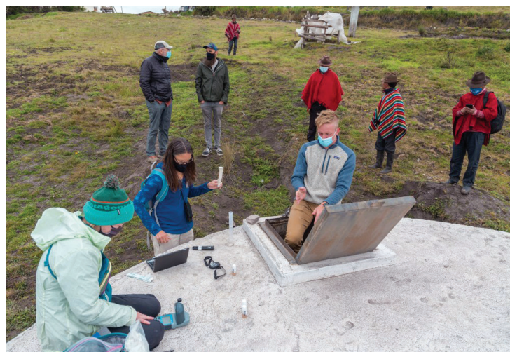
(above) Calvin University's water quality testing research, completed in the summer of 2021, was foundational to producing the technical paper.